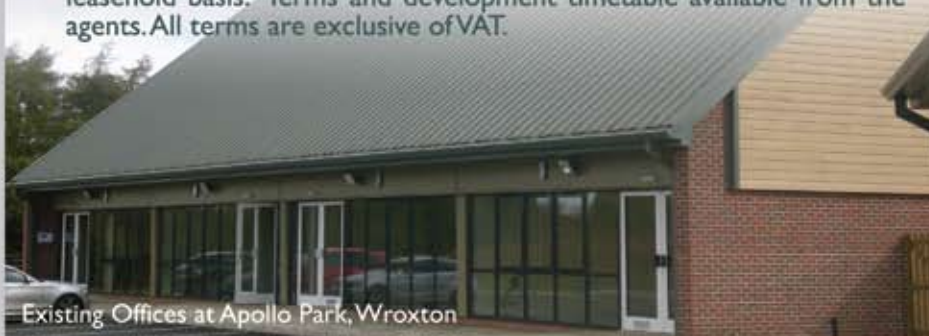
Existing Offices at Apollo Park, Wroxtton